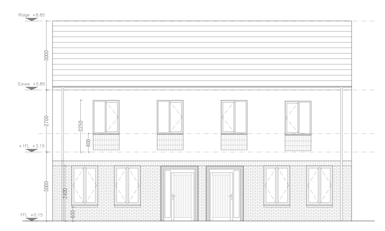
House Type K Semi-Detached Front Elevation